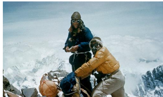
Edmund Hillary and Tenzing Norgay, 1953

The newest project from Bowers Museum's ongoing partnership with the Royal Geographical Society (with IBG), Everest: Ascent to Glory combines photographs, films, and artifacts from five expeditions leading up to and including the earliest successful attempt to climb the colossal mountain. Having marked the centennial of the first British reconnaissance expedition to Mount Everest (1921-2021), this holistic exhibition explores the history, resolute characters, unsung heroes – including Tibetan and Nepalese Sherpas – and changing technologies of the initial attempts to climb the tallest mountain on earth.