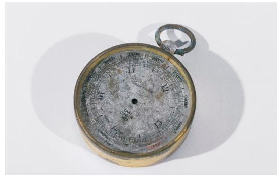
Altimeter found on George Mallory's body