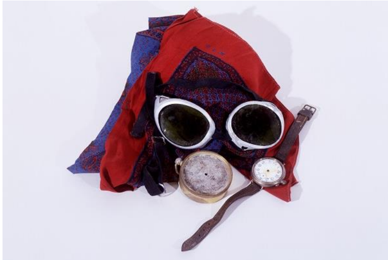
George Mallory's Goggles, wristwatch with leather strap, altimeter and handkerchief

June 3, 2022 (Santa Ana, California) – From the Hubbard Medal awarded to members of the 1953 expedition, to tools and equipment found in 1999 when George Mallory's remains were discovered on Everest, Bowers Museum is thrilled to share the addition of 11 new objects to the current featured exhibition Everest: Ascent to Glory . Coming straight from display in National Geographic's Once Upon a Climb exhibition, these new objects enhance the already remarkable collection now on view through August 28.