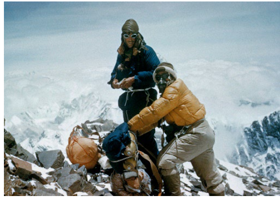
Image Left: Edmund Hillary and Tenzing Norgay, 1953

On the heels of the centennial of the first British reconnaissance expedition to Mount Everest (1921-2021), this holistic exhibition curated by Wade Davis, the award-winning author of Into the Silence: The Great War, Mallory and the Conquest of Everest , explores the history, resolute characters, unsung heroes – including Tibetan and Nepalese Sherpas – and changing technologies of the initial attempts to climb the tallest mountain on earth.