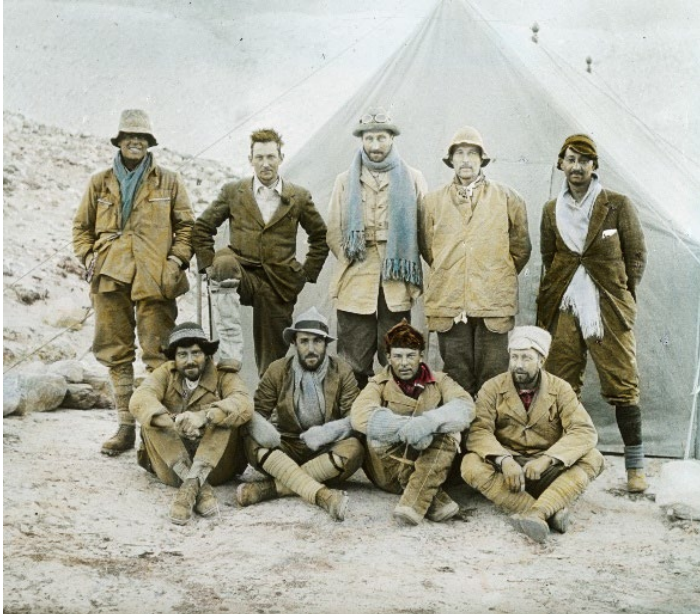
The 1924 Mount Everest Expedition in camp