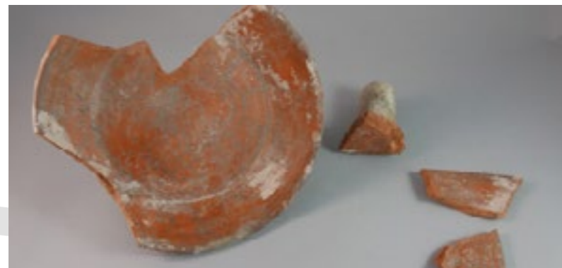
Tripodal Bowl Fragments, 15th to early 16th Century Aztec culture; State of Mexico or Morelos, Mexico Ceramic; 3 3/4 x 8 3/4 in. 96.37.17 Gift of Mr. Carlos Von Son

Materials with an (*) are optional, use only if available.